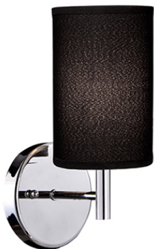
601071 B CH